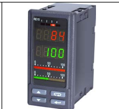
IntraCon Digital Controllers