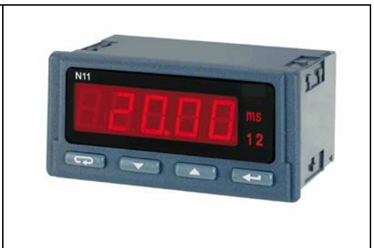
IntraDigit Digital Indicators / Meters