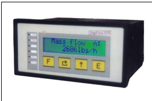
DigiFlow Flow and Level Computers