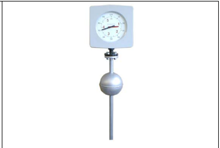
MAGLINK Level Indicator