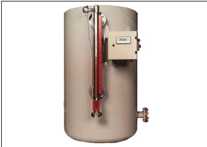
ITA-mag. Level Gauge