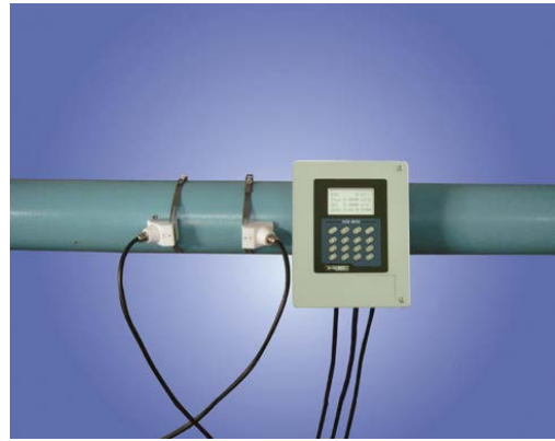
IntraSonic IS210 Ultrasonic Flow Meter